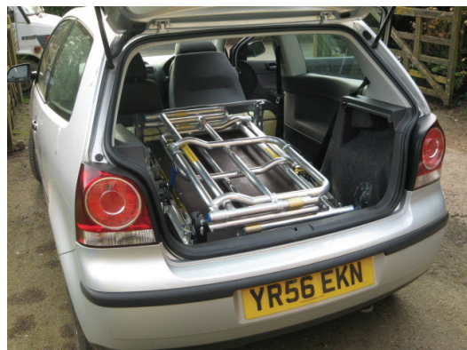
or in a VW Polo