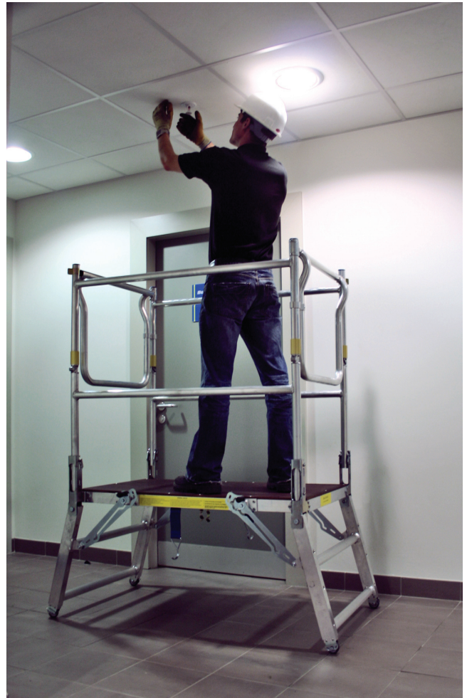
Figure 1: The DeltaDeck® access platform

Load tests were carried out in the most onerous configuration of maximum leg extension and lowest angle setting.