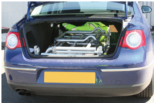
in a VW Passat